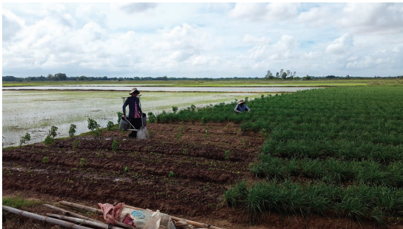
Deltas are global intensive food production areas.

exposure to environmental change has important consequences on people's livelihoods and human development of the delta regions and beyond. In the case of the Amazon delta, the state-level human development index of the Brazilian State of Pará, where most of the deltaic area is located, is the third lowest among the 27 Brazilian states, with the education subindex ranking second poorest. 7