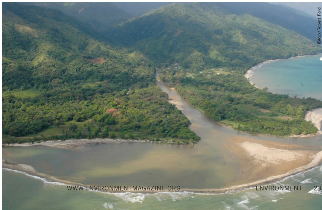
A delta on the Caribbean coast of Honduras.